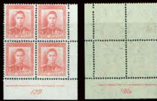
1700 both sides